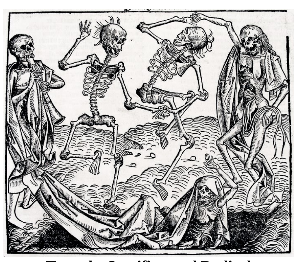
Tragedy, Sacrifice, and Radical Politics